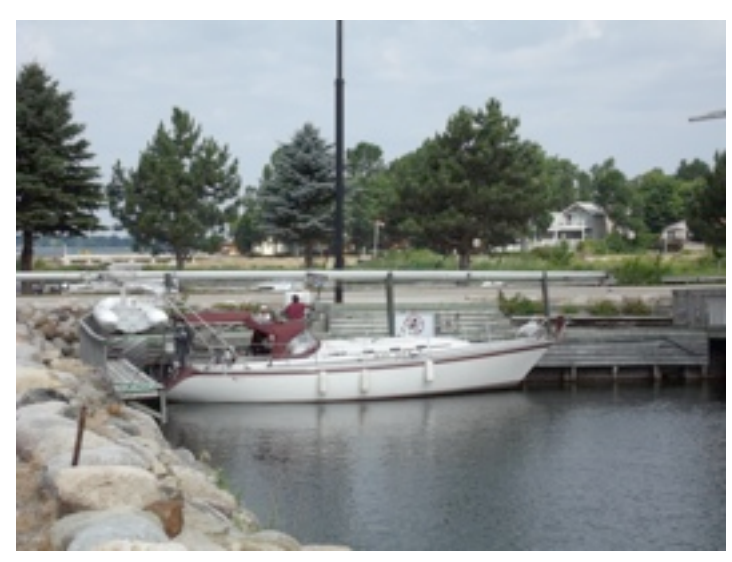
The following day Jorge treated us to a meal at the Quarter Deck Restaurant which is just off of the property. The burgers were good and the beer was cold - what else do you need?