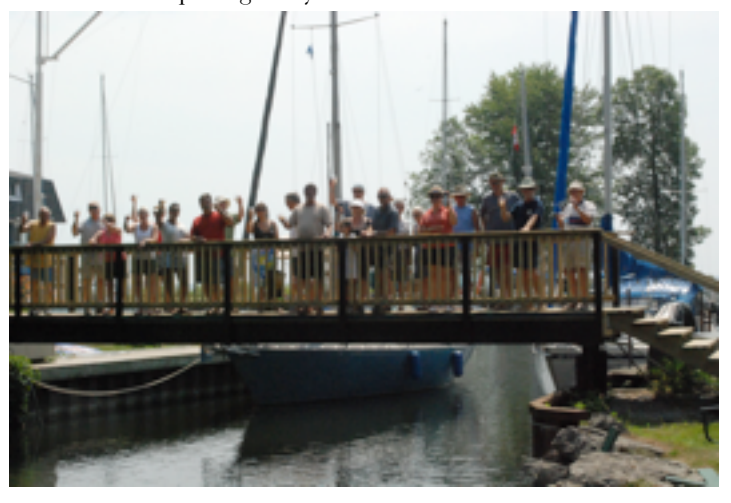
All that's left is the cleanup...