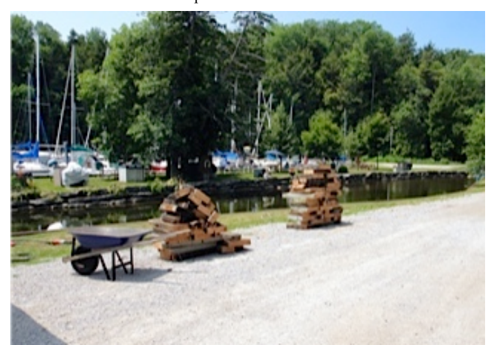
And no more crossing by water!